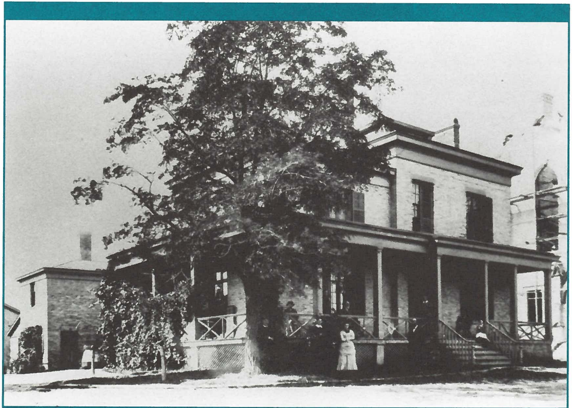
The original Milwaukee Hospital was a remodeled farmhouse on the outskirts of town.

The first patient admitted to The Passavant on August 3, 1863, is thought to have been a Norwegian sailor suffering from tuberculosis. Many early patients were sick or disabled veterans of the Civil War, and an