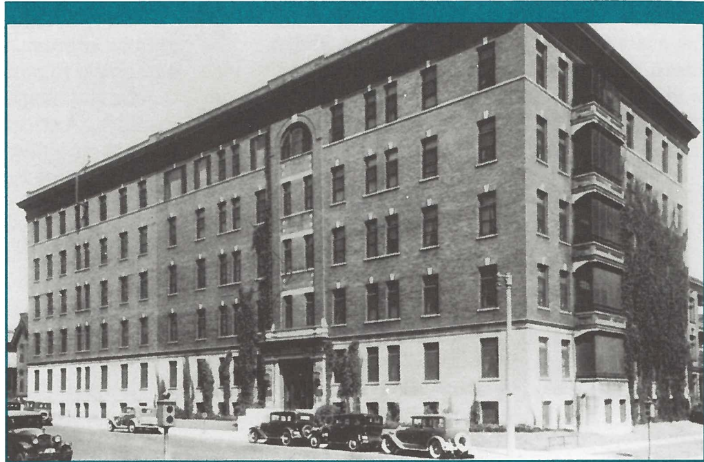
The new 60-bed Mount Sinai Hospital was dedicated in 1914; this building, and additions made in 1922 and 1938 comprise 1993's "R" building.

The hospital had 15 beds — seven private rooms and two four-bed wards. A public appeal brought donations of beds, linens, and other furnishings. Seventeen staff physicians represented the medical specialties of the times, and a Free Dispensary — an integral part of the Mount Sinai history — was opened to serve the indigent. Two hundred patients, half of them non-Jewish, were treated at the hospital that first year and receipts totaled $7,000.