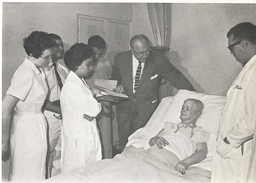
Tender, loving care is a vital ingredient to quality care as this young patient is learning.