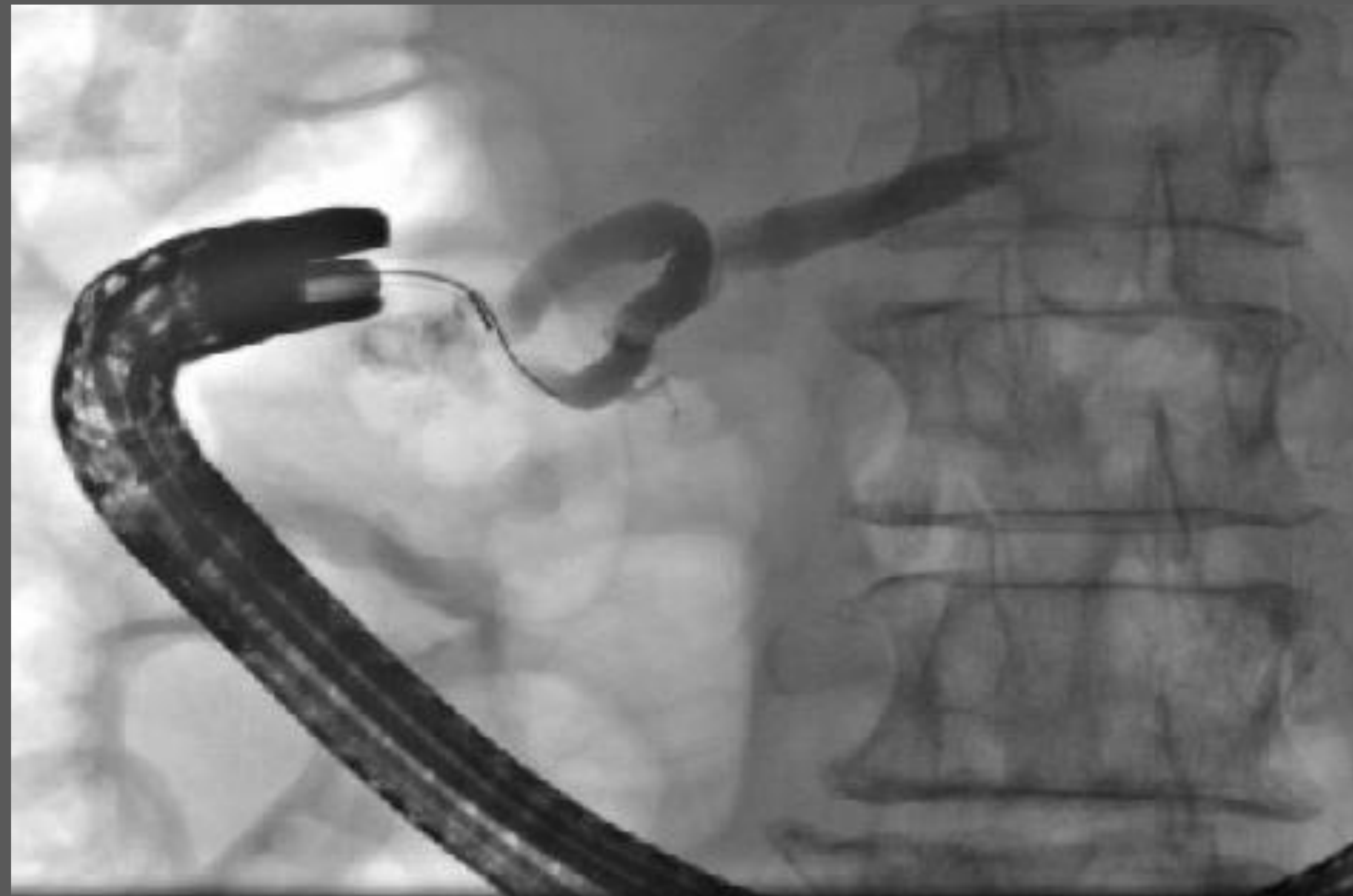
Figure 1. ERCP cholangiogram representing ANSA pancreatica.

We present a case of recurrent pancreatitis secondary to suspected ansa pancreatica. Ansa pancreatica is a rare anatomic variant, prevalence of 0.5-0.9%, described as an "S shaped loop" connecting the accessory pancreatic duct to the main pancreatic duct (1-6). There is an association between acute pancreatitis and ansa pancreatica, however, the mechanism is not well understood. This case highlights the anatomic variant specific to a dominant dorsal draining duct treated with a minor papillotomy and stone extraction. Further investigation is needed to address endoscopic cannulation of this anatomic variant and the association with acute pancreatitis.