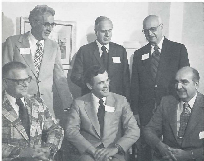
The Ob-Gyn Department of Lutheran Hospital sponsored a conference featuring statewide and visiting speakers. Pictured here are several of the panel members who contributed to the success of the conference.