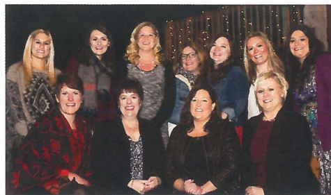
One of these SANE nurses is always available to offer this specialized care at Aurora Medical Center in Oshkosh.

To make a gift or learn more, contact Beth Oswald at beth.oswald@aurora.org .