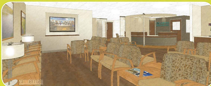
The new waiting room at Aurora West Allis will help the hospital meet the growing needs of the surrounding community.