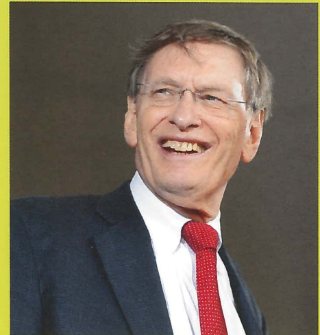
Bud Selig, a Milwaukee native, is best known for his extended tenure as the Commissioner of Major League Baseball.

Bud Selig will be recognized at the Lombardi Award of Excellence dinner on April 9, 2016 at The Pfister Hotel in Milwaukee, WI. To learn more about this event, or to purchase tickets go to LombardiFoundation.org